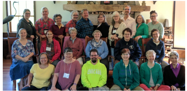
First Participating in God's Power class in January, 2020.